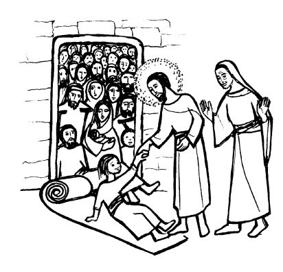
The whole town came crowding round the door, and he cured many who were suffering from diseases of one kind or another;